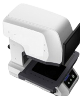
TOP SIDE OF MACHINE