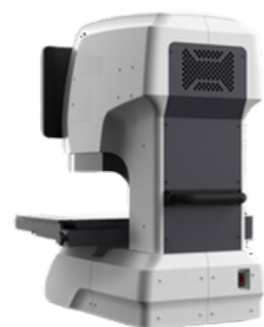
BACK OF MACHINE