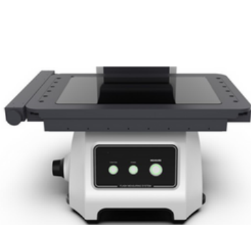
FRONT OF MACHINE